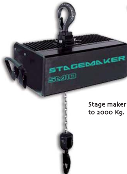
Stage maker: capacity from 125 Kg to 2000 Kg. Stage maker standard