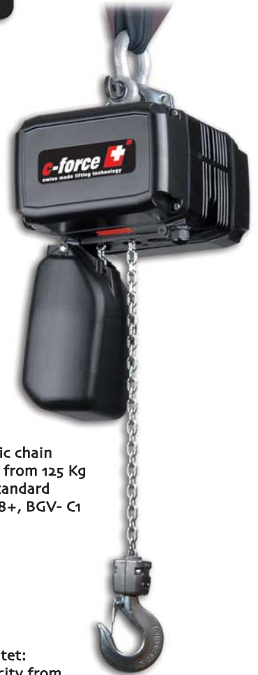
C-force: Electric chain hoist, capacity from 125 Kg to 2.500 Kg. Standard version, D8, D8+, BGV- C1